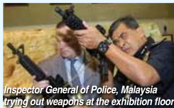
Inspector General of Police, Malaysia trying out weapons at the exhibition floor