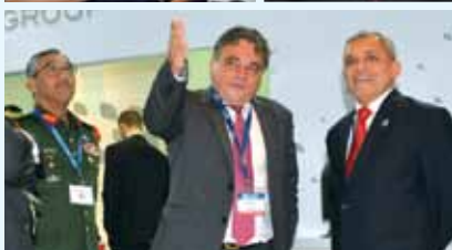
Malaysian Chief of Army, engaging with an Exhibitor