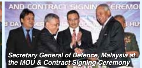
Secretary General of Defence, Malaysia at the MOU & Contract Signing Ceremony