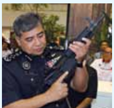
Minister of Defence, Singapore arriving for his Keynote Address