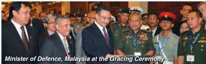
Minister of Defence, Malaysia at the Gracing Ceremony