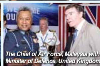
The Chief of Air Force, Malaysia with Minister of Defence, United Kingdom