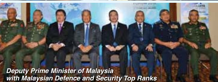
Deputy Prime Minister of Malaysia with Malaysian Defence and Security Top Ranks