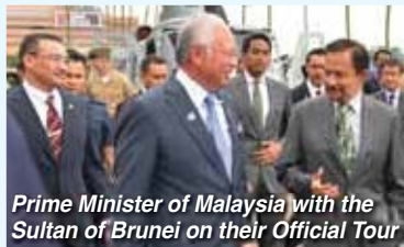
Prime Minister of Malaysia with the Sultan of Brunei on their Official Tour