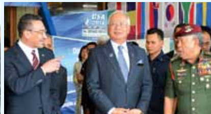
Signing the board in remembrance of MH370