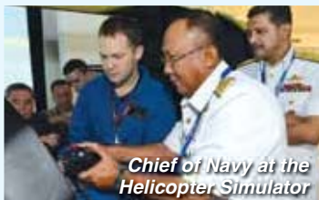
Chief of Navy at the Helicopter Simulator