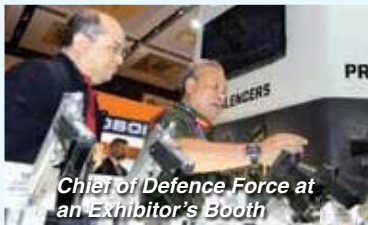
Chief of Defence Force at an Exhibitor's Booth