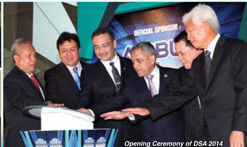
Opening Ceremony of DSA 2014